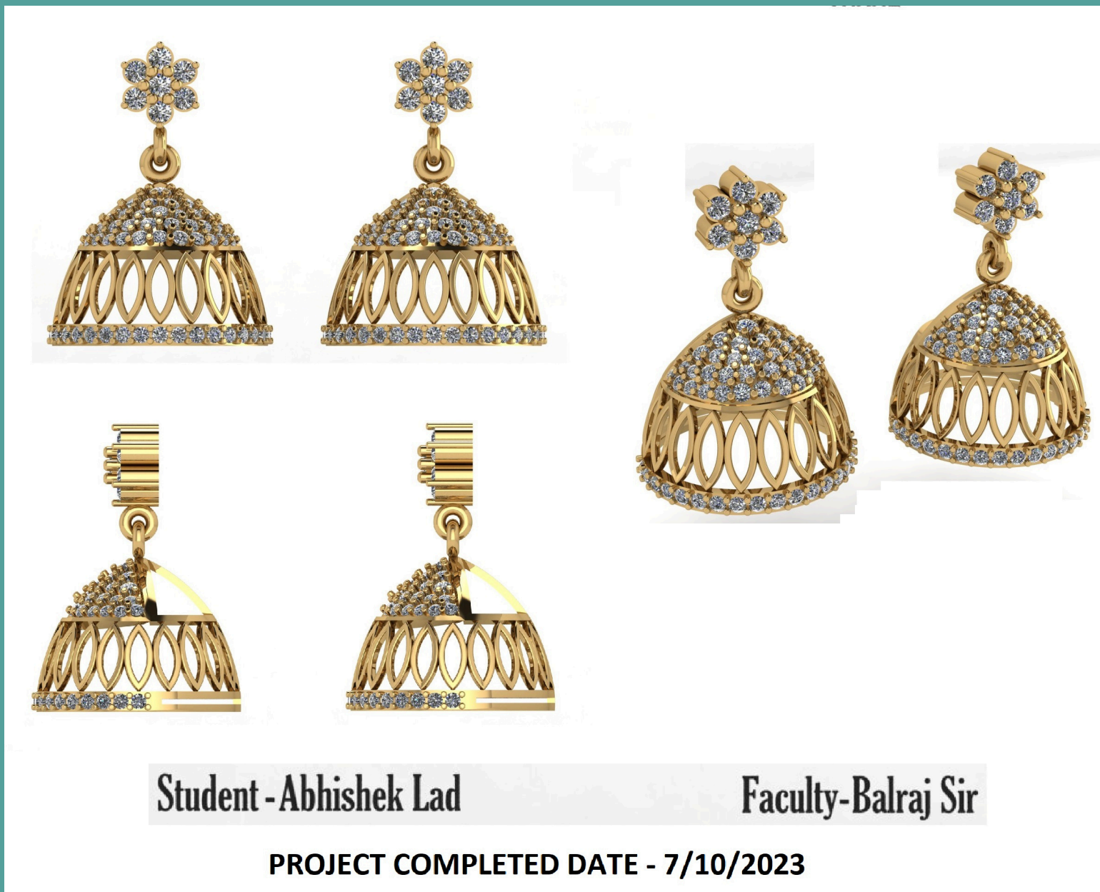
Student - Abhishek Lad